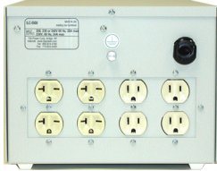
Rear view with optional receptacles